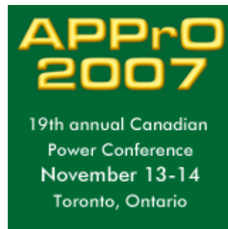
Button – under vertical right, (160x160)