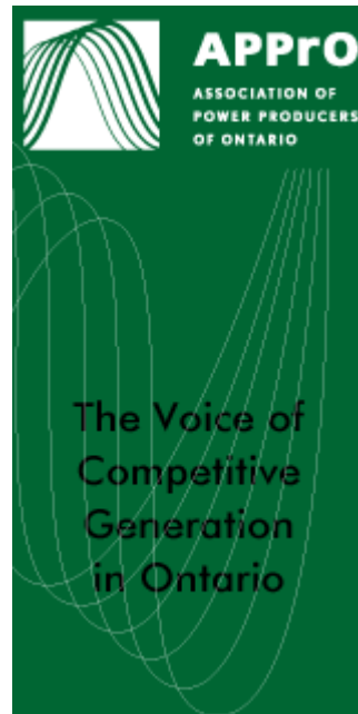
Skyscraper – vertical, left or right side (160x300 pixels)