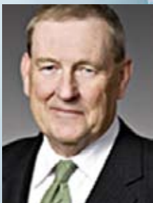
Hon. Gerry Phillips Ontario Minister of Energy