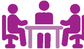
Hosted virtual meeting rooms and sub-sessions