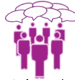
Discussion forums on key issues, including topics that emerge spontaneously during the event