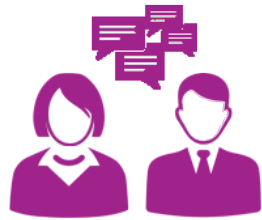
Live chat, Q&A and polling, riffing off the main session