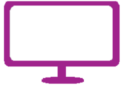
The main conference program

See, visit, engage with and interact through key parts of the event platform