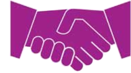
Virtual meetups and other networking functions